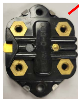
High limit tripped normal condition.