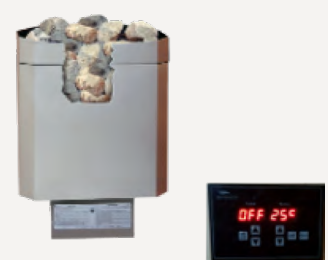
Sauna Craft CW-XR w/ EL-13 Control

LK Plus (2×4 benches) + the following: CW-XR Heater & EL-13 electronic control Designer backrest, top tier bench skirt Accessories: bucket, ladle, thermometer, light shade Exterior casing and extra vent cover Clear cedar lining (11/16")