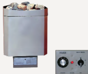
Sauna Craft CW-M w/ TPT3 Control

Clear cedar, 1×4 benches 1×4 cedar bench tops (bench substructure by others) Full depth bottom bench - No supports Clear cedar lining (11/16")