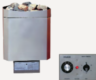
Sauna Craft CW-M w/ TPT3 Control

Clear cedar, 2×4 benches 2×4 cedar bench supports Clear cedar lining (11/16")