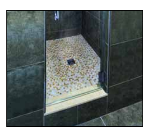
Schluter*-KERDI is used to provide waterproofing and vapor protection in wet areas (e.g., showers, steam showers, tub surrounds, etc.) and is easy