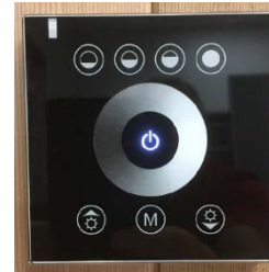
Dimmable LED Control