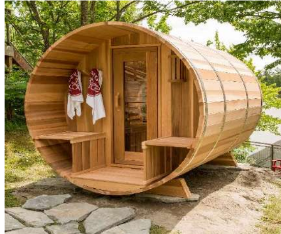
Patio Stones/Paver Blocks

(Refer to the below chart for minimum base requirements)