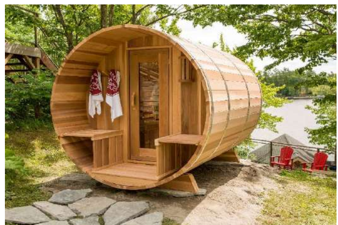
Patio Stones/Paver Blocks

(Refer to the below chart for minimum base requirements)