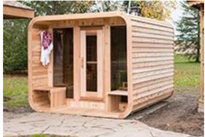
Patio Stones/Paver Blocks

(Refer to the below chart for minimum base requirements)