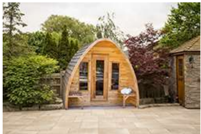
Patio Stones/Paver Blocks