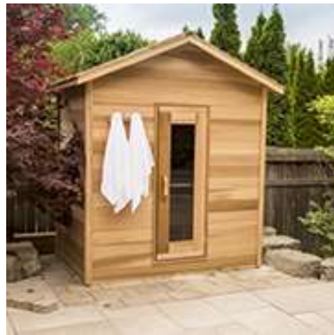
Patio Stones/Paver Blocks

(Refer to the below chart for minimum base requirements)