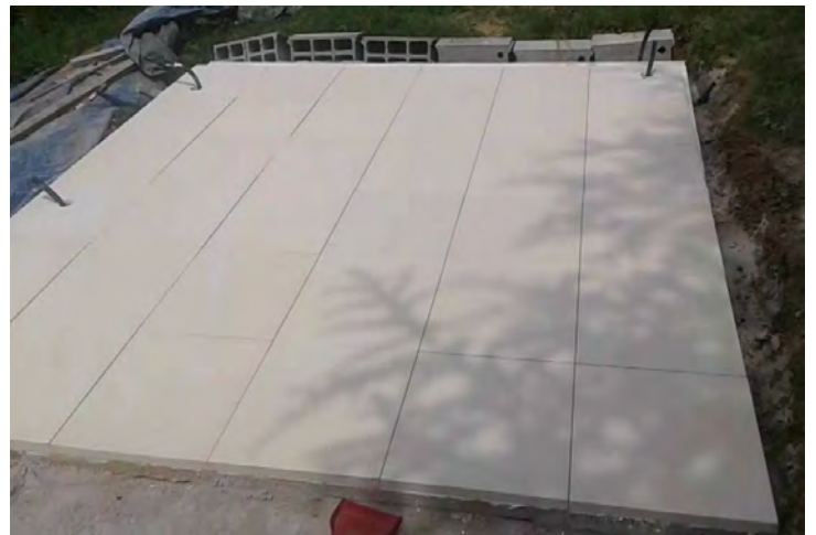
Patio Stone/Paver Blocks

It is recommended to build a base larger than required to provide a sitting area for cooling off during your sauna session.