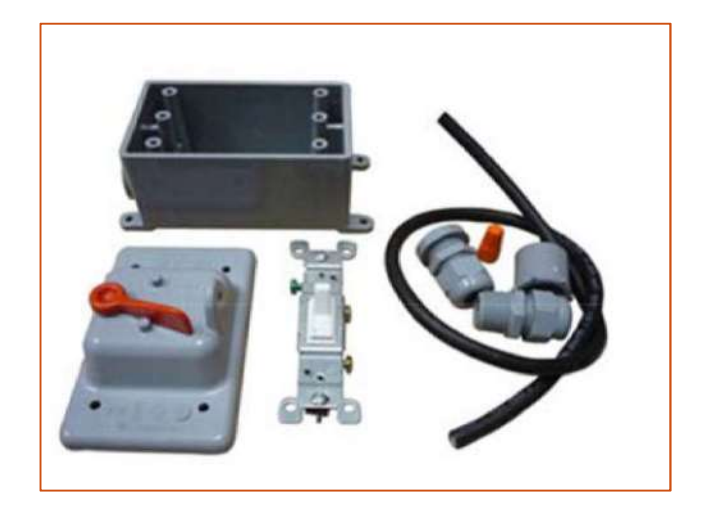
Weatherproof Light Switch (purchased separately)

If you are installing a light switch on the outside of your sauna, it is recommended to install it outside the door using the appropriate weatherproof conduit and switches.