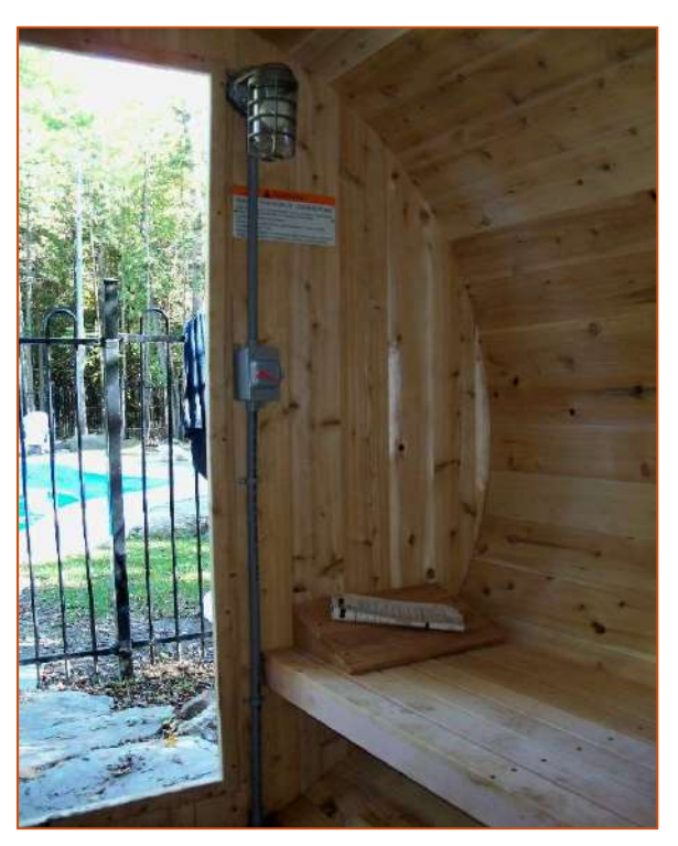
The best placement for your light would be inside the sauna to the right of the door on the front wall. (as shown)