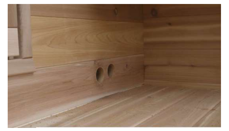
Drill inlet holes centered underneath the heater on the front wall close to the floor.

Hole saw or drill bit to drill holes Cordless Drill Robertson bit