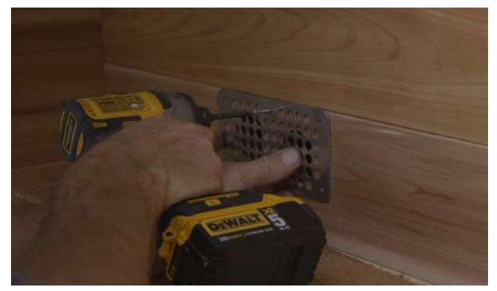
Install 1 of the stainless steel vent grills over the inlet holes on the outside of the sauna centered over the holes using 1\,\% " (38mm) screws. (6pcs)