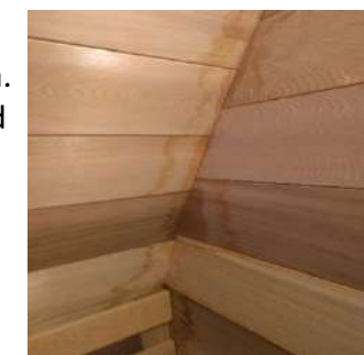
Normal Water seepage

If the water marks are bothersome, they can be easily removed with a light sanding (80 or 100 grit)