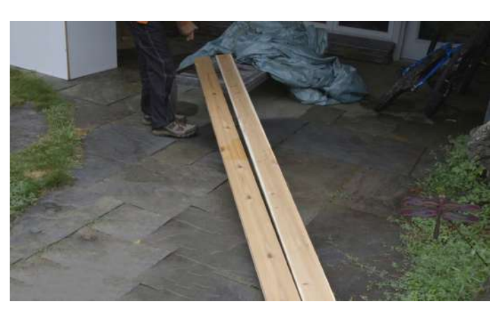
Locate the 2 top roof staves. These will be flat on one side and concave on the other.

Install the top back wall panel in the same manner as the front.