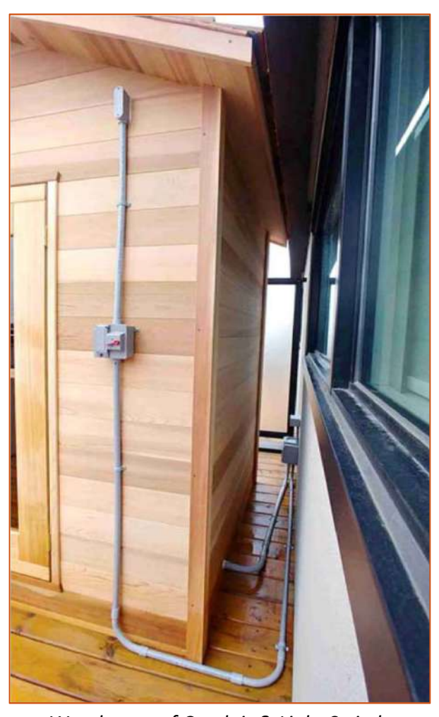
Weatherproof Conduit & Light Switch

For the mini pod sauna, you can use weatherproof boxes, conduit and light