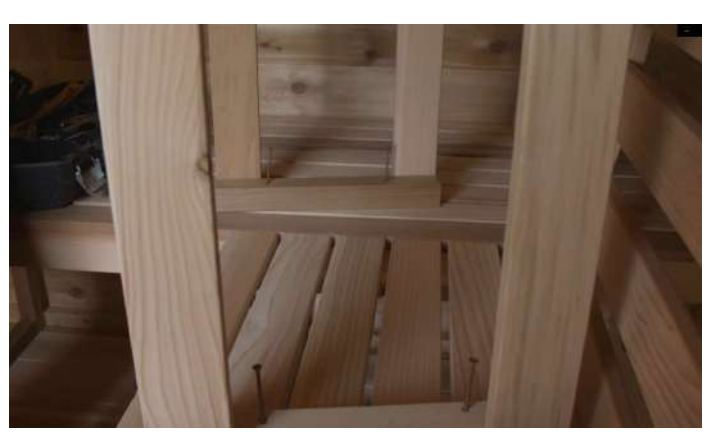
Pre place 2 ½" (64mm) screws in the pre drilled holes of your assembled heater guard.

Make sure front supports are flush to the sides and secure with (2) -1 %" screws per side.