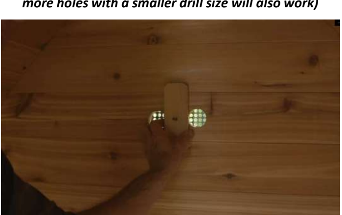
Drill the outlet holes high up on the back wall in the same manner as the front wall. Install the stainless grill on the outside and then the sliding vent cover inside with a 1 ½" (38mm) screw.

* A 2" diameter hole saw was used in pictures but more holes with a smaller drill size will also work)