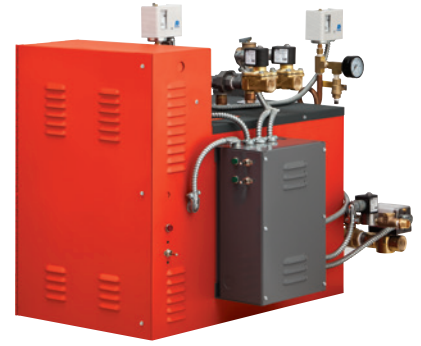
MODELS HC-30/36/48 Dimensions: 39"L x 22"W x 28"H