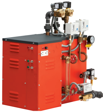
MODELS HC-9/12/15/18/24 Dimensions: 21"L x 19"W x 25"H

ASME Authorized Certificate Holder. All of our HC Series Steam Generators are certified and stamped to meet stringent ASME codes and UL standards.